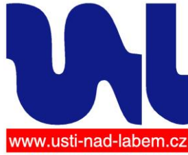
HEAD REGIONAL CITY