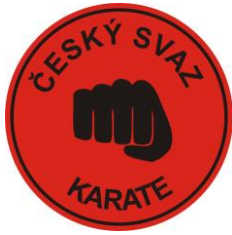
CZECH KARATE FEDERATION