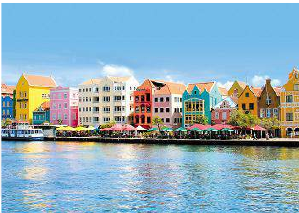
Downtown Willemstad on the Punda side, the capital of Curacao.