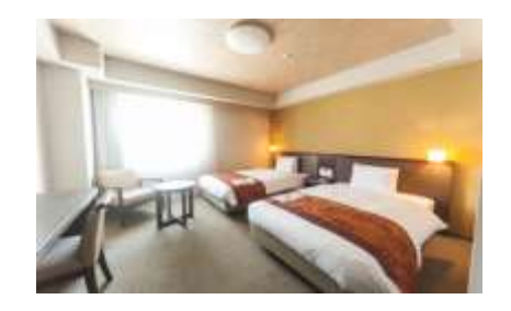
Daiwa Roynet Hotel NAHA-KOKUSAIDORI