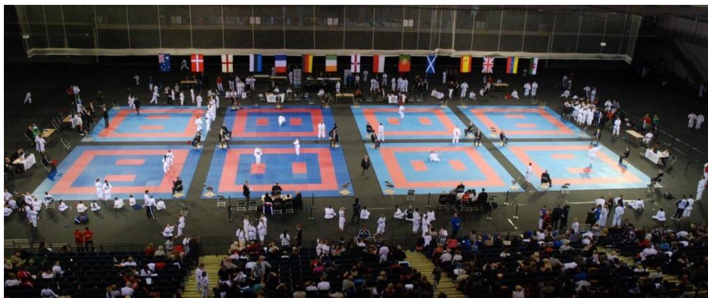
BKF at GLASGOW EMIRATES ARENA