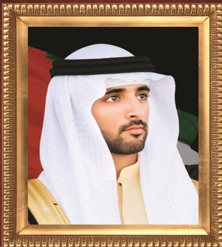
Under the Patronage of H.H Sheikh Hamdan Bin Mohammed Bin Rashid Al Maktoum Crown Prince of Dubai